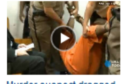
Murder suspect dragged through courtroom by 6... Oct 25, 2012