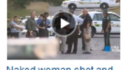
Naked woman shot and killed by police Oct 22, 2012