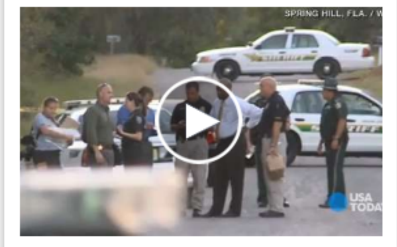
Naked woman shot and killed by police Oct. 22, 2012